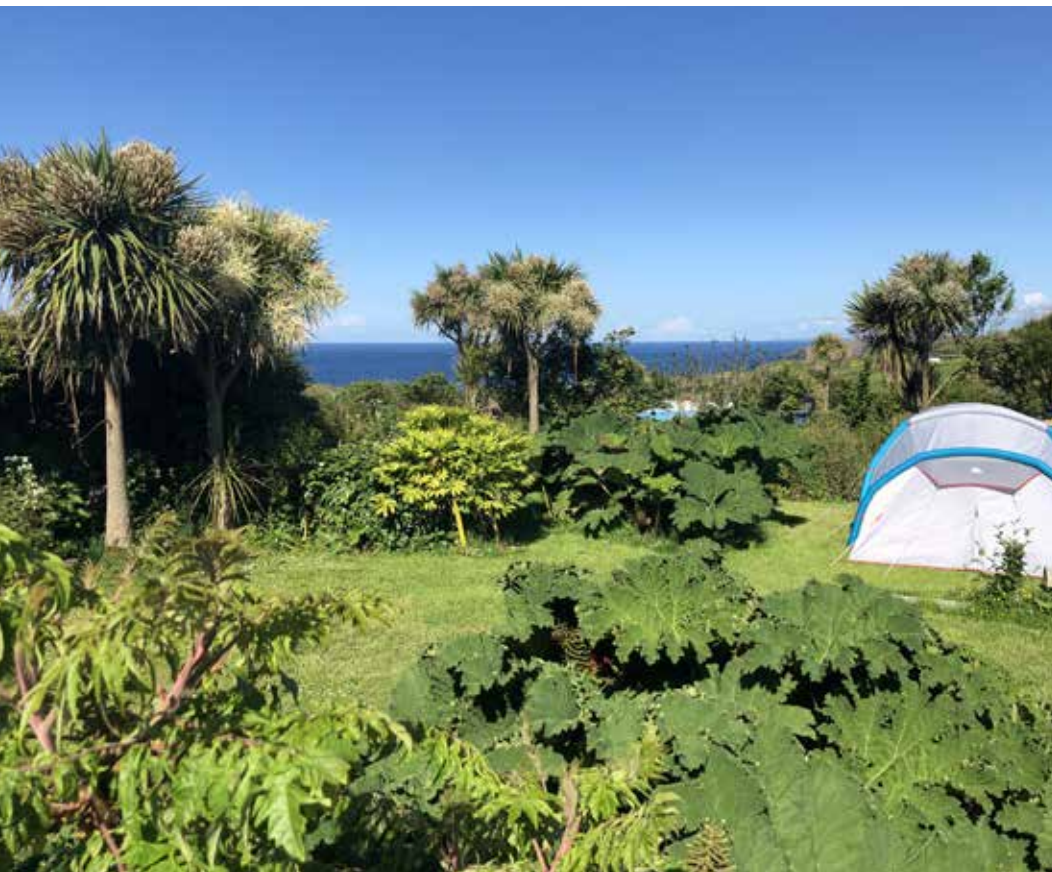
ABOVE The planting at Henry's near Helston ensures a bit of privacy as well as a superb sea view