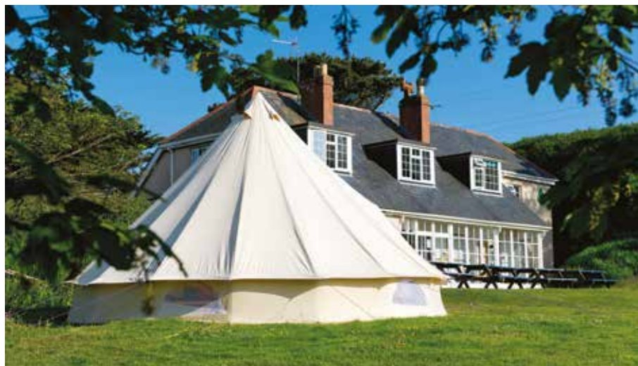
TOP Enjoy exploring beautiful Bryher in the Isles of Scilly CENTRE & ABOVE The YHA Lands End hostel is close to St Just, has a range of camping options plus a licensed bar and self-catering kitchens