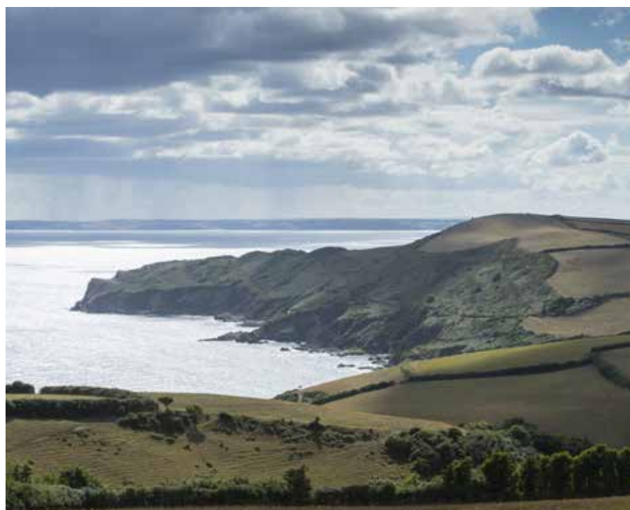
TOP Pop into a pod at Beersheba Farm ABOVE Highertown is a campsite run by the National Trust

HIGHTERTOWN PHOTOGRAPH © NATIONAL TRUST IMAGES/CHRIS LACEY BEERSHEBA WILDFLOWER WOOD PHOTOGRAPH KISS PHOTOGRAPHY